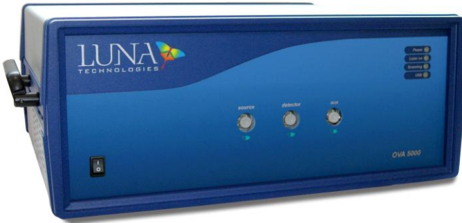
OPTICAL VECTOR ANALYZER™ (Model 5000)