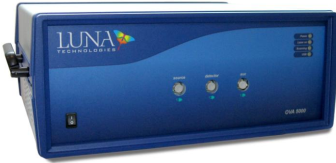
OPTICAL VECTOR ANALYZER™ (Model 5000 LP)