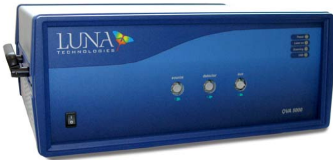
OPTICAL VECTOR ANALYZER™ (Model 5000 LP)