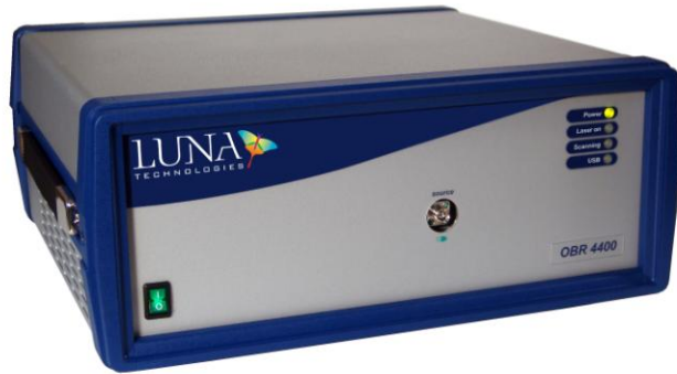
OPTICAL BACKSCATTER REFLECTOMETER™ (Model OBR 4400)