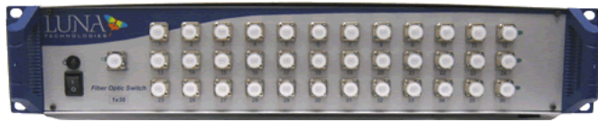
FIBER OPTIC SWITCH (Model 036)